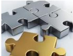
Say Goodbye to the Age of Generalizations: How