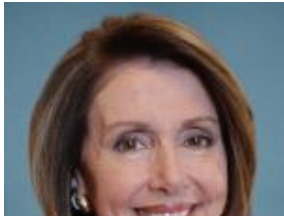
Pelosi Dead-Wrong On New Law