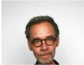
The Most Popular FishbowlNY Stories for the