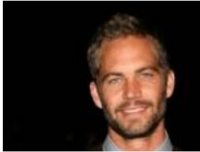
The Most Popular FishbowlNY Stories for The