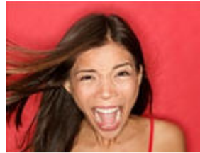
Credit Cards With No Interest Until 2015? Yep.