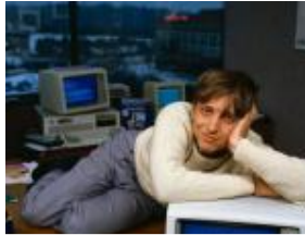
8 Billionaires Who Never Bothered to Get a College