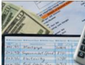
8 Expenses You Can Stop Paying Today